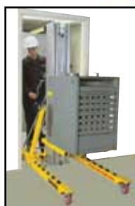
Fits through doorways!

Using plunger pins, forks remove and reverse easily for added height or to get flush with a ceiling. No loose pieces!